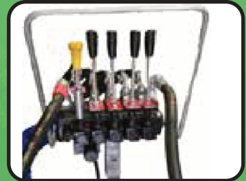
Standard Manual Control