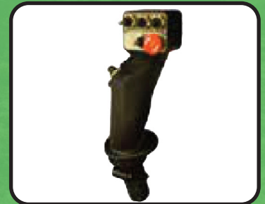
Optional Electric Joystick (Req. Tractor w/ Cab)